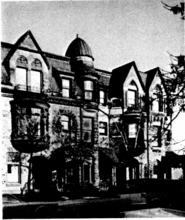
These Queen Anne style row houses located at 164-172 Eugenie Street are typical of the sort built near Lincoln Park in the late 1800s. The interesting rooflines, the asymmetrical window arrangement, and the variety of building materials make these houses some of the most elaborate in the Old Town Triangle District.

portion of North Town. Many of these houses still exist and are typical of the urban housing that characterized American cities at this time: flat- or bay-fronted, tall and narrow in proportion, and usually two or three stories tall. As in the Chicago cottages, a broad stairway leads to the first-floor entrance. Bays, when used, rise the height of the building. Sandstone lintels, sometimes decorated with incised patterns, top the windows, and stringcourses of sandstone divide the stories. The contrast of this material with the surface of the wall creates variety and texture in the facades. Ornate cornices detailed with dentils and supported by brackets almost invariably top the buildings.